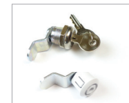
125-1073 Key Lock 125-1678 Hex Lock