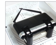
Rail Mounting System (RMS)