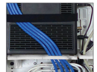
Shelf Mounting System (SMS)