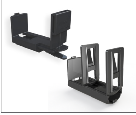
Single & double mounting brackets (RMB/RMB2)