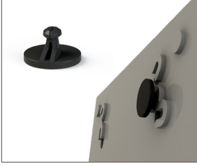
Keyhole mounting bracket (KMS)