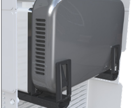
Multiple component mounting