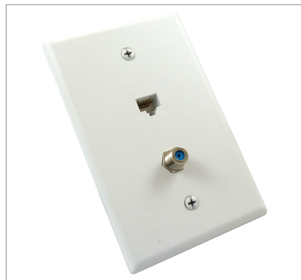
Coax and Cat6 model