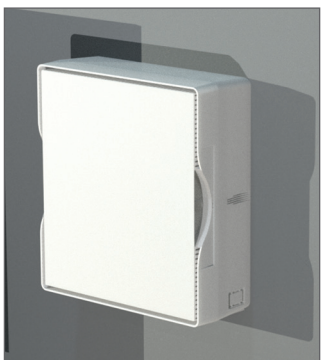
Retrofit construction (Brownfield) on-wall Installation