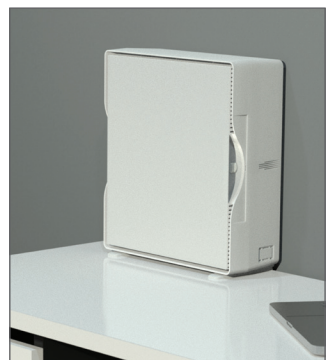
Freestanding (w/accessory feet)