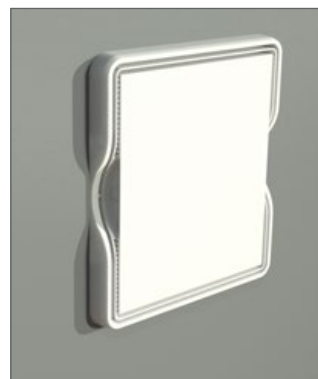
New construction (Greenfield) in-wall Installation