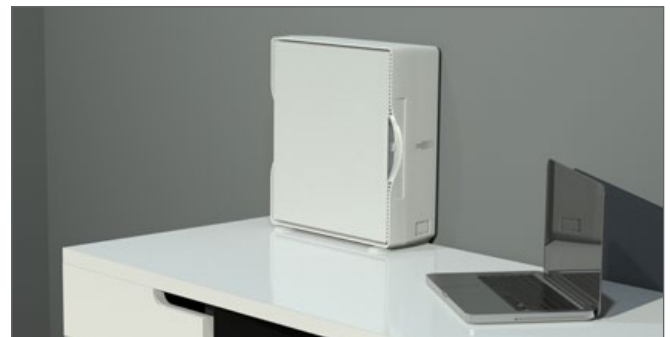
Freestanding (w/accessory feet)