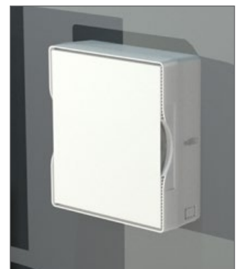
Retrofit construction (Brownfield) on-wall Installation