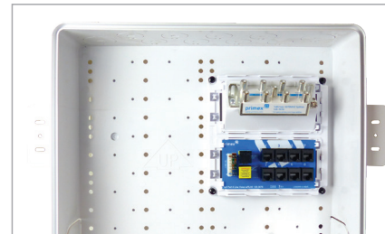
Installs quickly and easily in Primex Verge MDE's