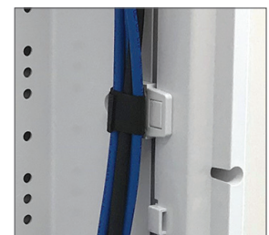
SMC fits mounting tape for cable management.