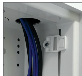
Installed SMC for affixing sidewall to stud.