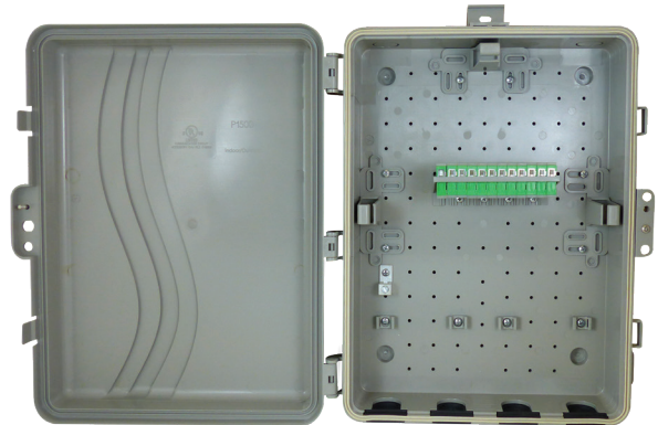
125-1451: 12 SC/APC simplex adapters, gasket, override, 3 Hurricane Clips, PVC