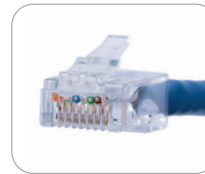
Cat6/5e UTP Snap Plug