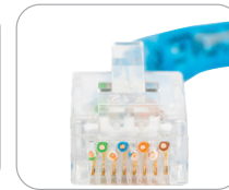
Cat6a UTP Snap Plug