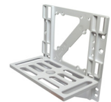
SMS Shelf Mounting System (Sold separately)