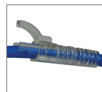
Boot for UTP Snap Plug