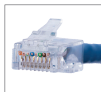
Cat6/5e UTP Snap Plug